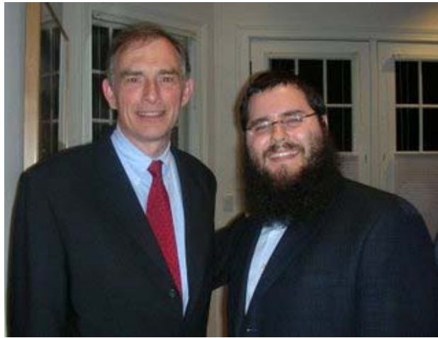
Congressman Pete Visclosky

...Declares his support for the Lubavitch Movement.